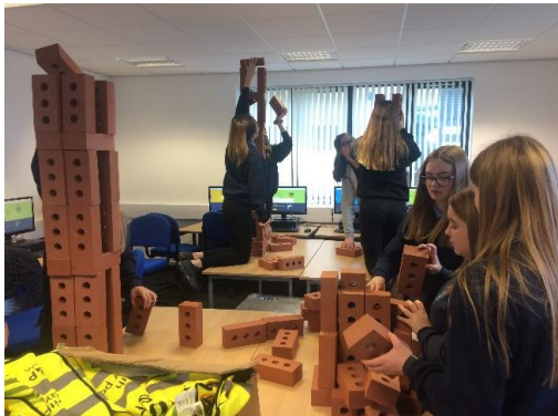
Year 9 'Girls into construction' at Coleg Llandrillo Menai