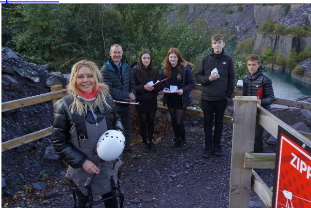
Carol Vorderman with STEM Gogledd participants at Zip World

https://www.bbc.co.uk/iplayer/episode/m000r944/carol-vorderman-closer-to-home-series-1-episode-2