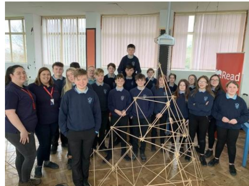
Ysgol Syr Thomas Jones, apprentice talks from Read Construction