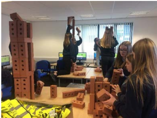
'Merched mewn adeiladu' Blwyddyn 9 yng Ngholeg Llandrillo Menai