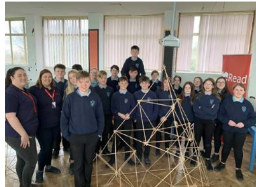
Ysgol Syr Thomas Jones, sgysiau gyda phrentisiaid o Read Construction