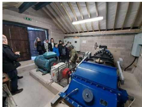
Ymwelodd chyfranogwyr â system bŵer trydan dŵr Ynni Ogwen ar yr Afon Ogwen.