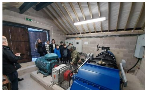
Participants visited the Ynni Ogwen Hydro-electric power system on the River Ogwen.