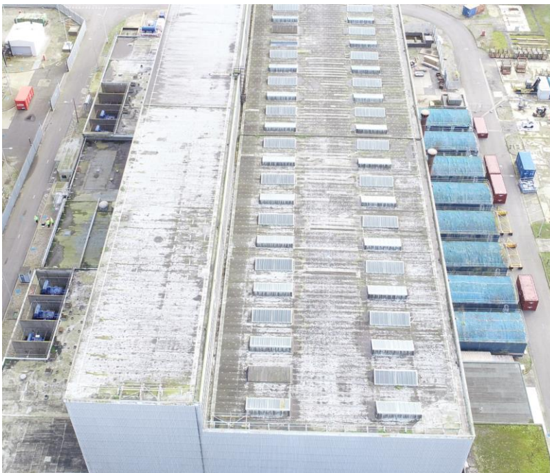
Tanks, above. and, left, an aerial view.