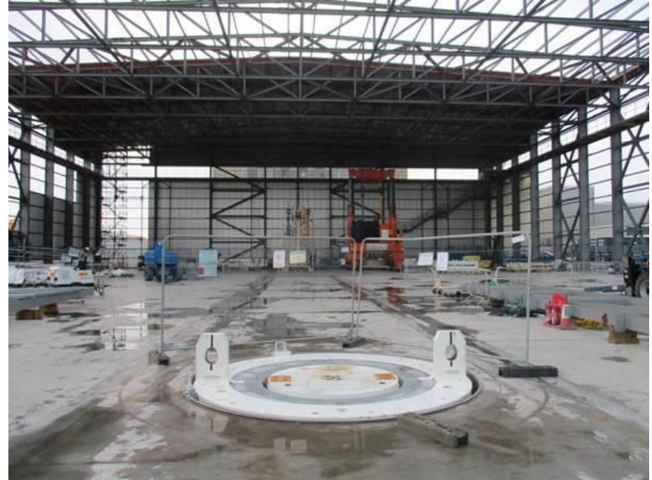
HiStorm in cask transfer facility